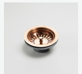
ACBWCU Basket Waste