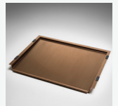
ACP109CU Bench Top Drainer Tray