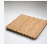
ACP104F Bamboo Board