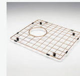
ACBPCU-2 Bowl Protector