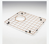
ACBPCU-2 Bowl Protector